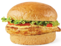
Grilled Chicken Sandwich

#11 Grilled Chicken Sandwich with fruit chews and a sweet tea.