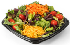
Garden Salad with Grilled Chicken

#16 Garden Salad with Grilled Chicken , Fruit Chews, and Sweet Tea.