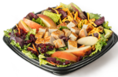
Apple & Cranberry Salad

Apple & Cranberry Chicken Salad with fruit chews and a sweet tea.